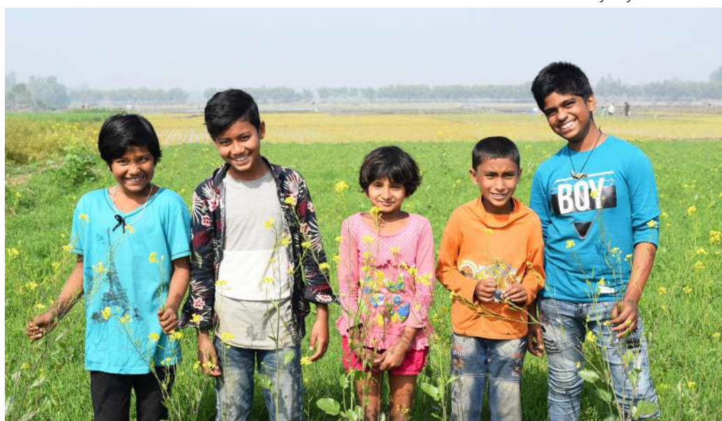
Happy children in a Nayakrishi village