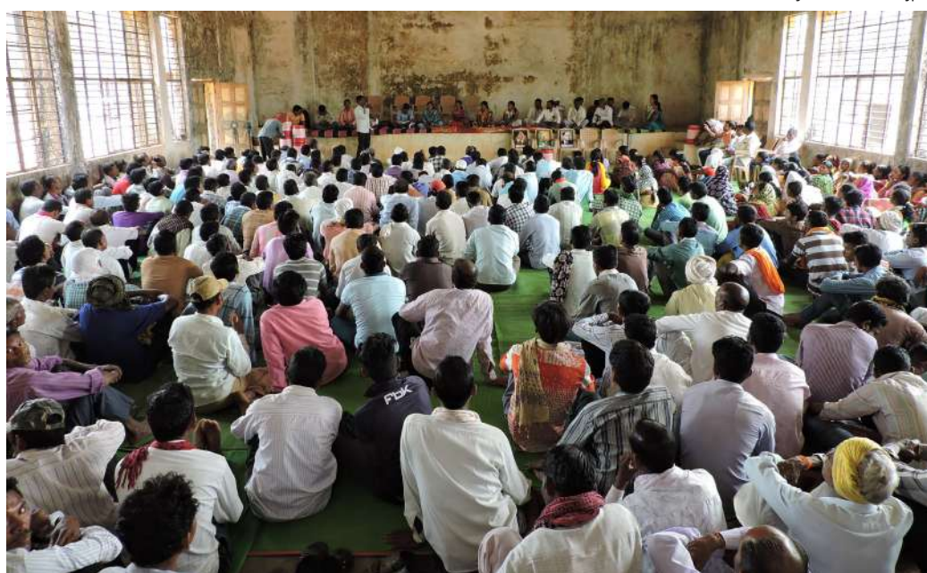
Tendu-pata auctioning meeting in Korchi