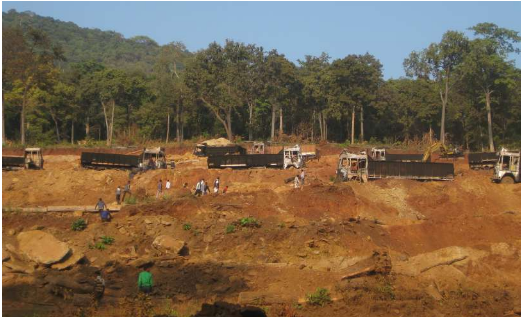
Mining in Surjagad in South Gadchiroli

Gadchiroli district in Maharashtra has a vibrant history of resistance movements over the years demanding village self-rule and rights related to forests and resources. With the enactment of FRA in 2006 and PESA Rules being drafted for the state of Maharashtra in 2014, a strong people's movement in Gadchiroli district was able to bring around 38 percent of forests under the control of gram sabhas by 2016.