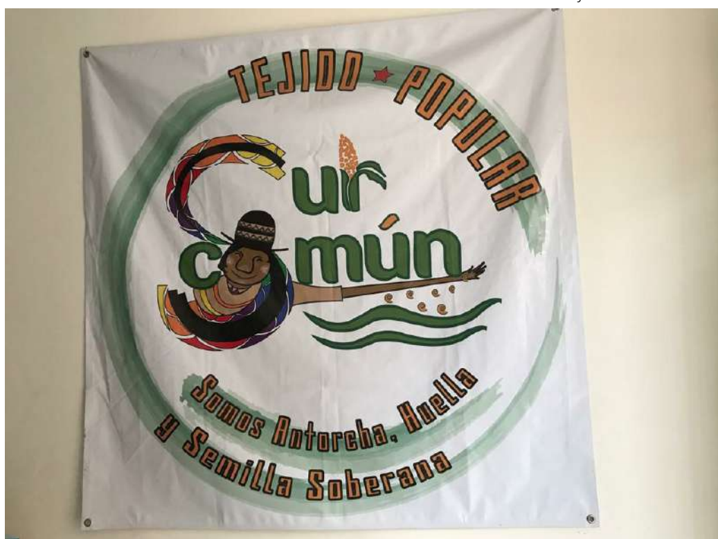
Poster by Surcomún