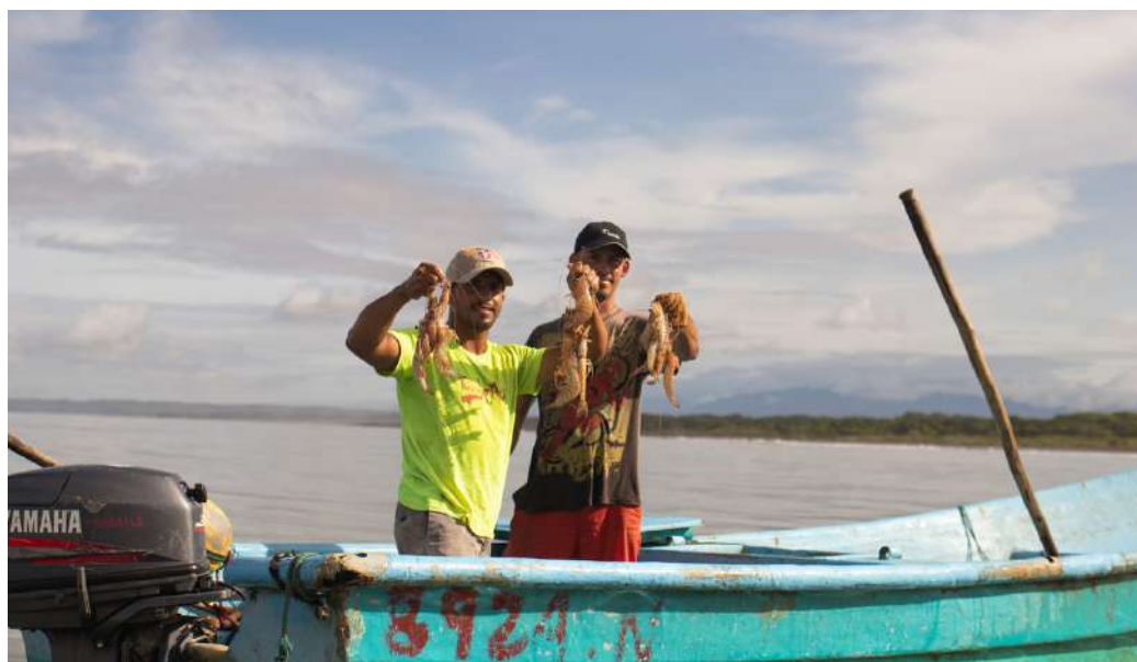
Tarcoles Marine Responsible Fishing Area, Costa Rica