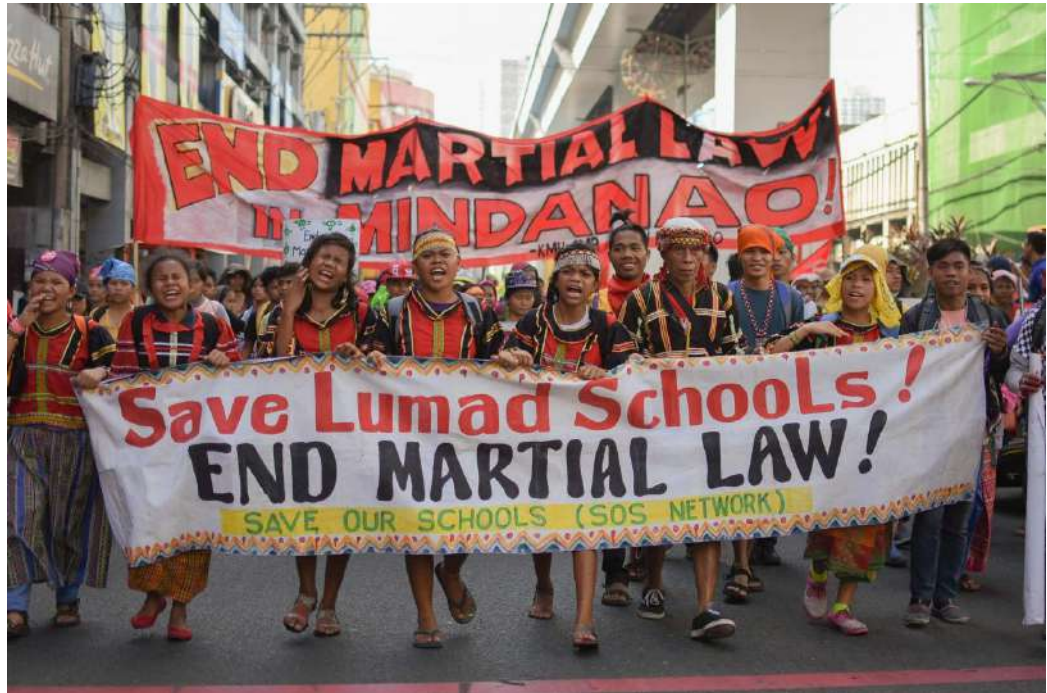
Protest to save Lumad Schools