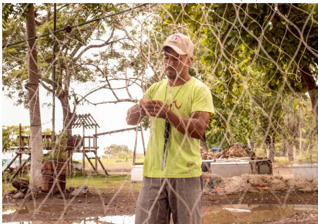
Working on a net