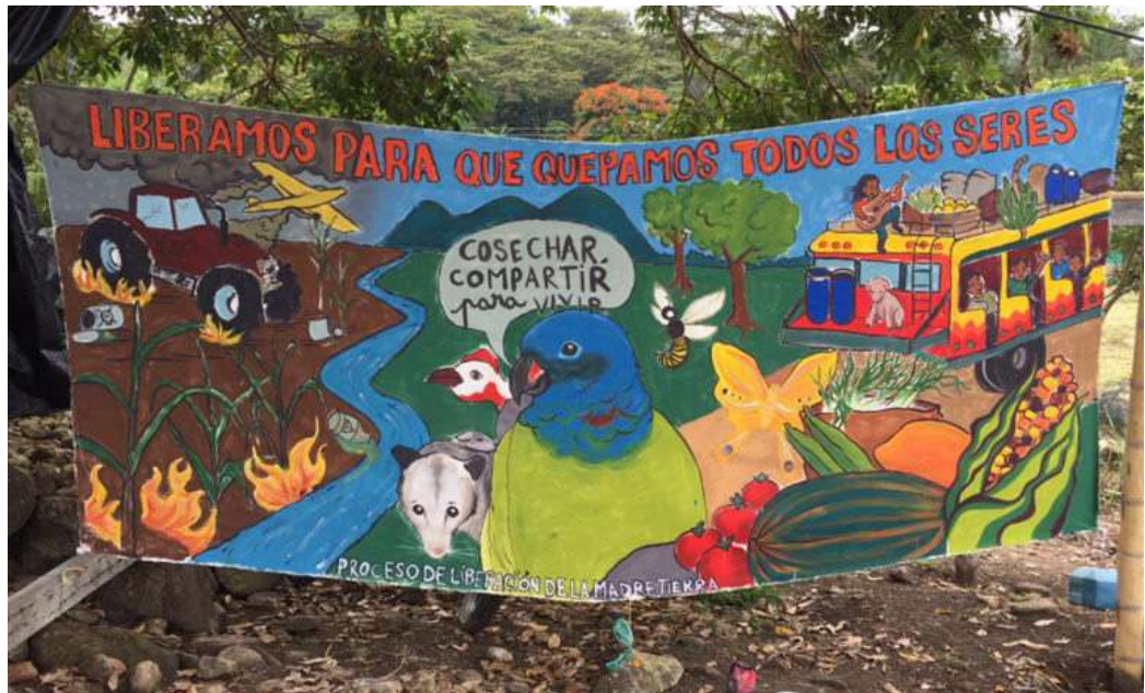
Painting by PLMT on their struggle