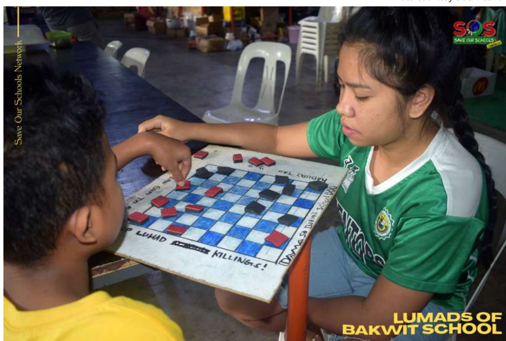
Bakwit school students