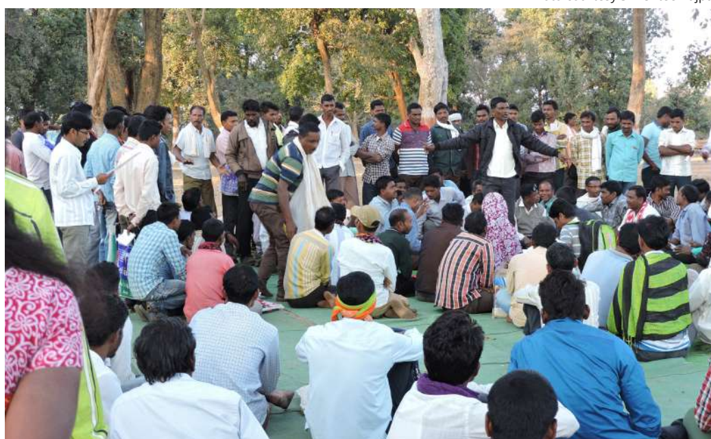
Maha Gramsabha meeting near Salhe village