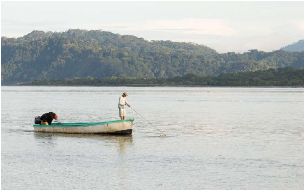
Tarcoles Marine Responsible Fishing Area, Costa Rica