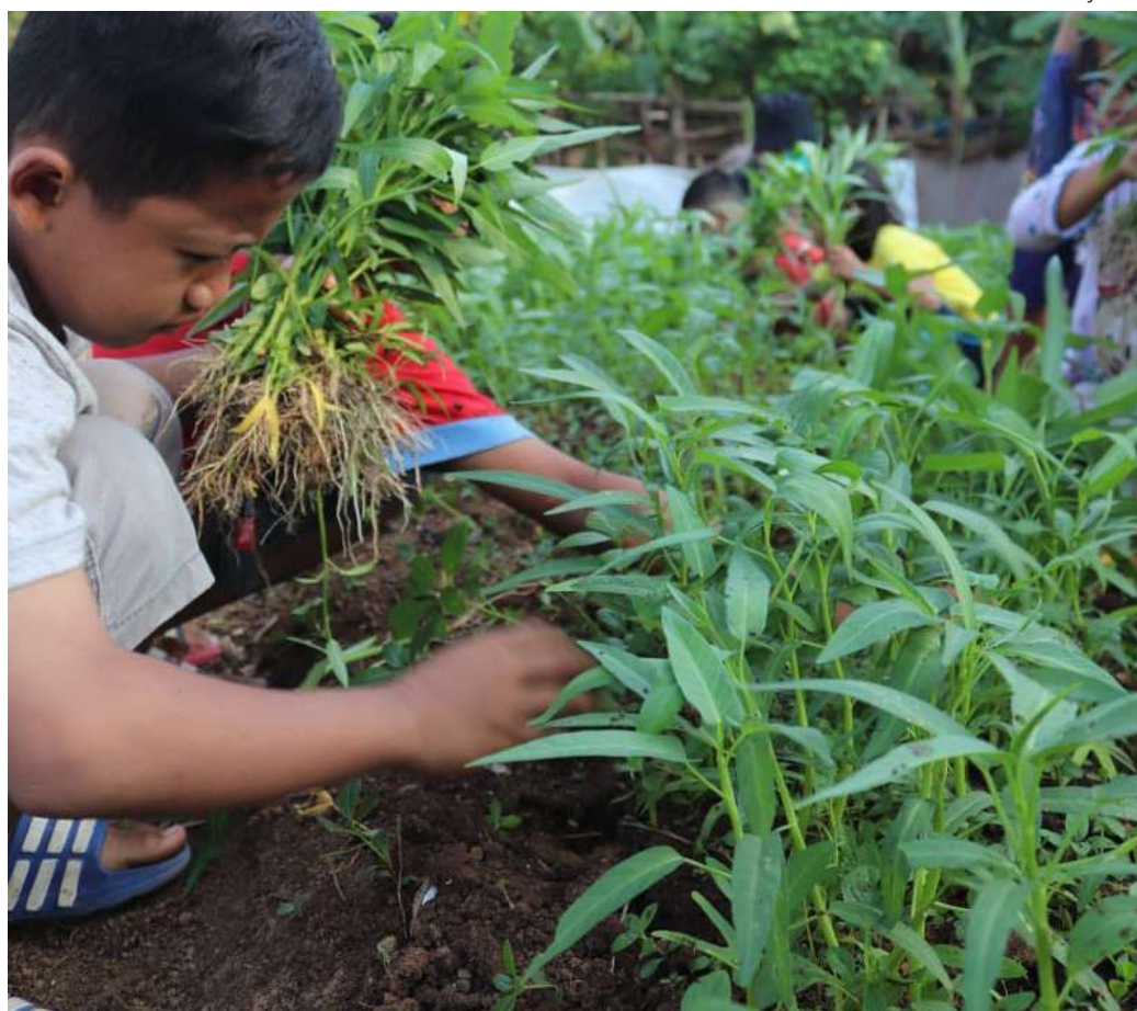
Children practicing urban farming