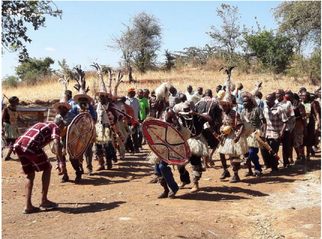
Community members celebrating with sacred dance after ritual ceremony