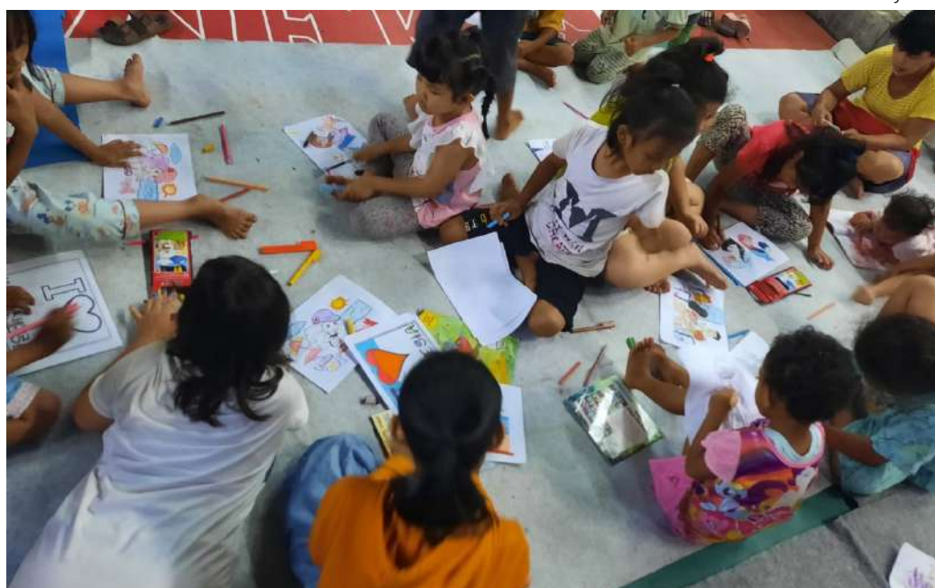
Children at a community library