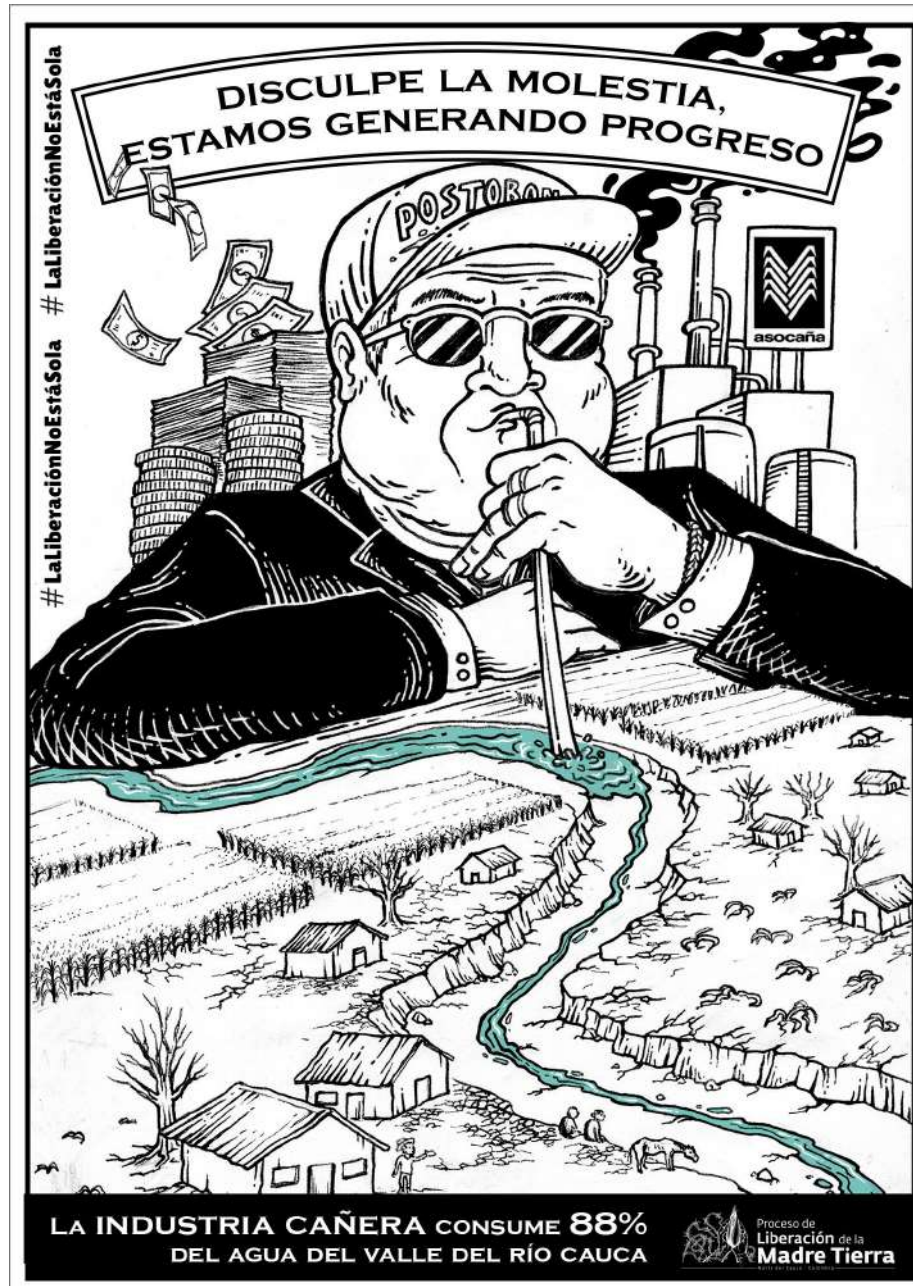
PLMTs poster on the politics of water