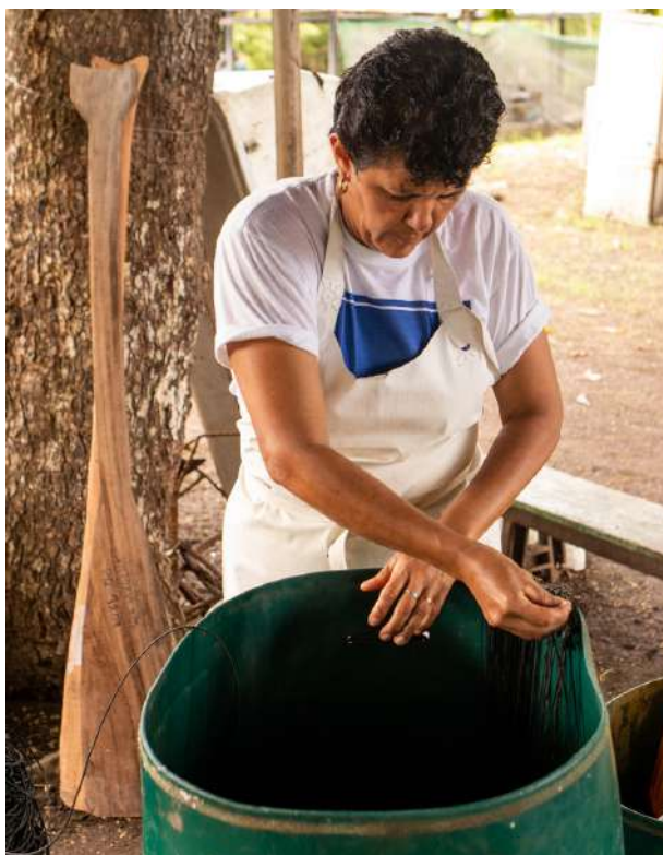
Processing sea products