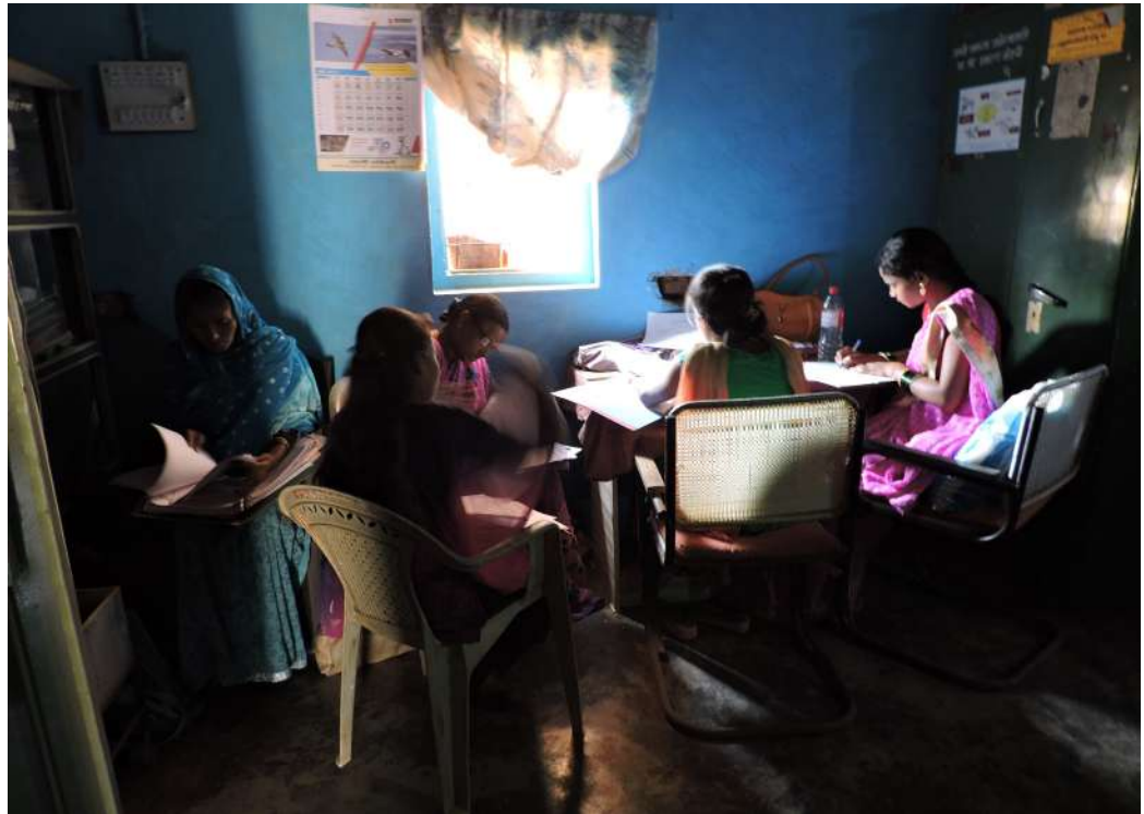
Active women members of the Maha Gramsabha, Korchi and Mahila Parisar Sangh, Korchi