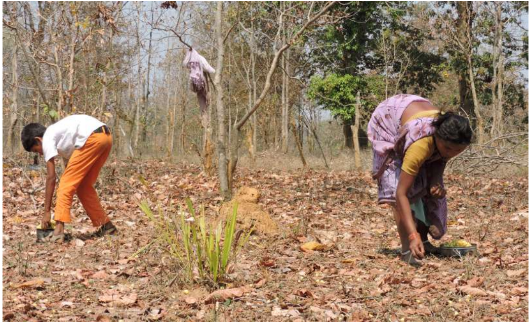
Women and her son collecting Muhua in the forest

In Ambagarh chowki, as COVID-19 was declared a pandemic, the gram sabhas initiated a full lockdown in their villages. With communities starting to face difficulties in accessing essential supplies, the gram sabhas devised systems of solidarity and localisation by distributing locally-procured medicinal plants and vegetables within the communities (CFR-LA, 2020).