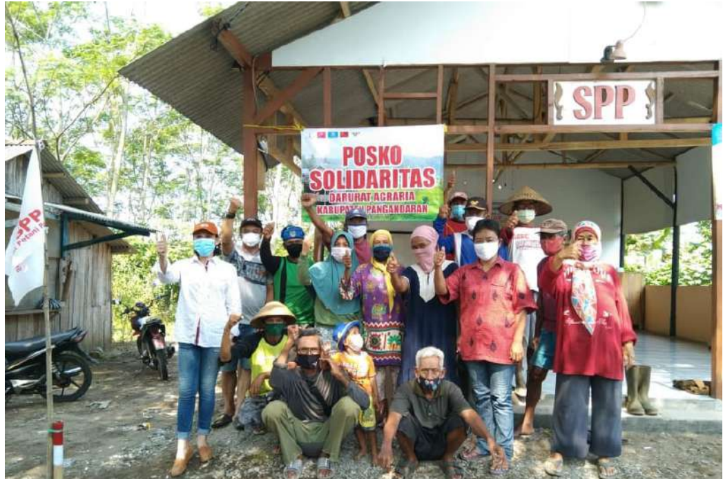
Farmers union Serikat Petani Pasundan organised posko solidaritas (solidarity place) for community members affected by COVID-19