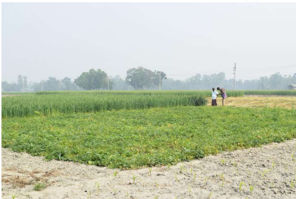
Farmers recovery after flood in 2020