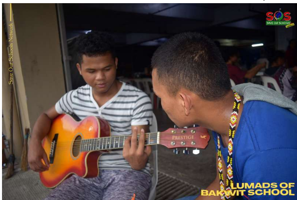
Bakwit school students