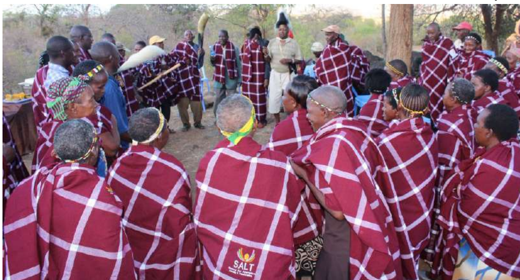
Community members engaging in dialogues on resilience