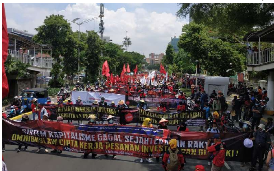
KPRI and their allies in protest against Omnibus Law